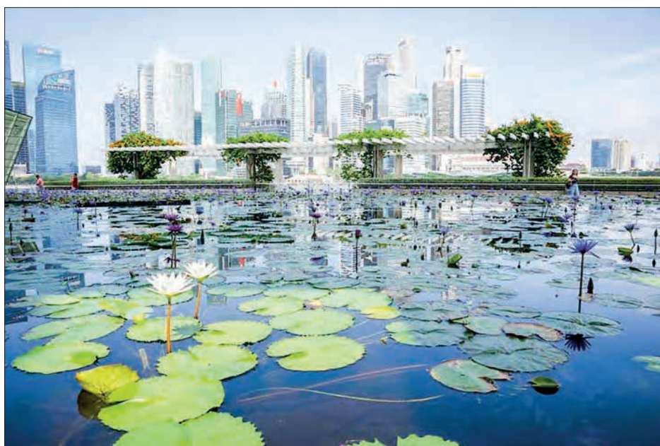
This photo taken on 13 August 2024 shows the business district at Singapore's Marina Bay.

The grant, available for a time-bound period of two years, will support enterprises that export to or operate in overseas markets and are affected by tariff measures. It will fund services such as free trade agreement and trade compliance advisory, legal and contractual guidance,