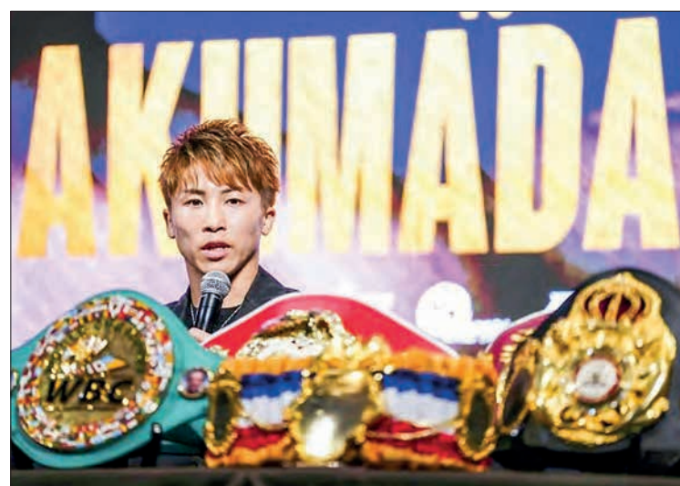
Japan's undisputed super-bantamweight world champion Naoya Inoue will defend his titles against Uzbekistan's Murodjon Akhmadaliev in September.