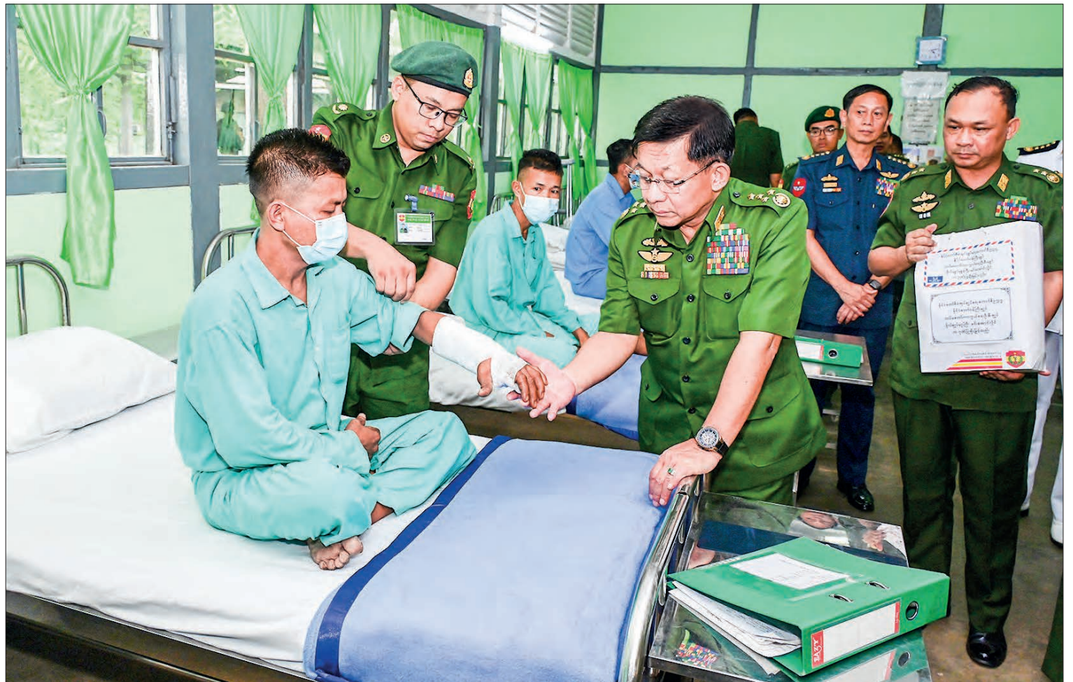
State Administration Council Chairman Defence Services Commander-in-Chief Senior General Min Aung Hlaing offers comfort to Tatmadaw patients at the Tatmadaw Hospital in Meiktila.

In his guidance, the Senior General stressed the need to provide medical protection and