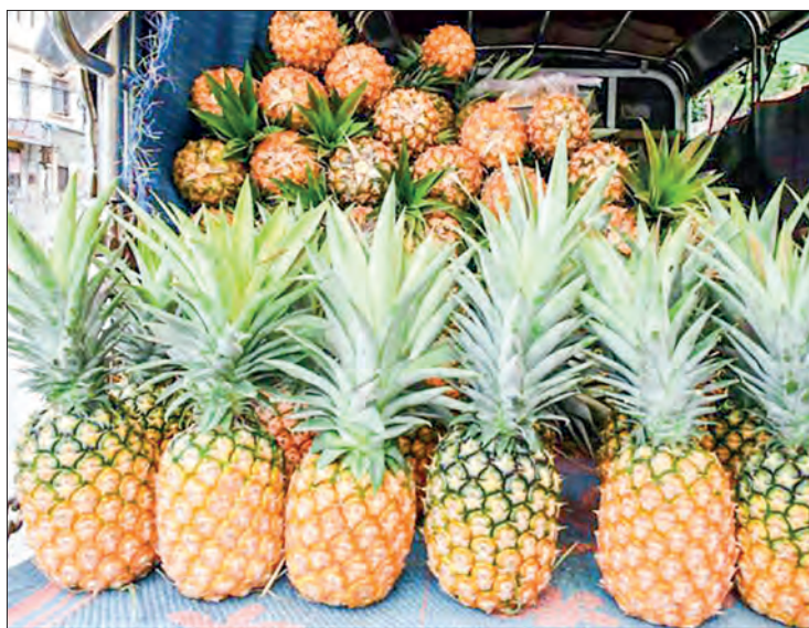
This photo shows pineapples from Shan States.

Myanmar's pineapple is cultivated in northern and southern