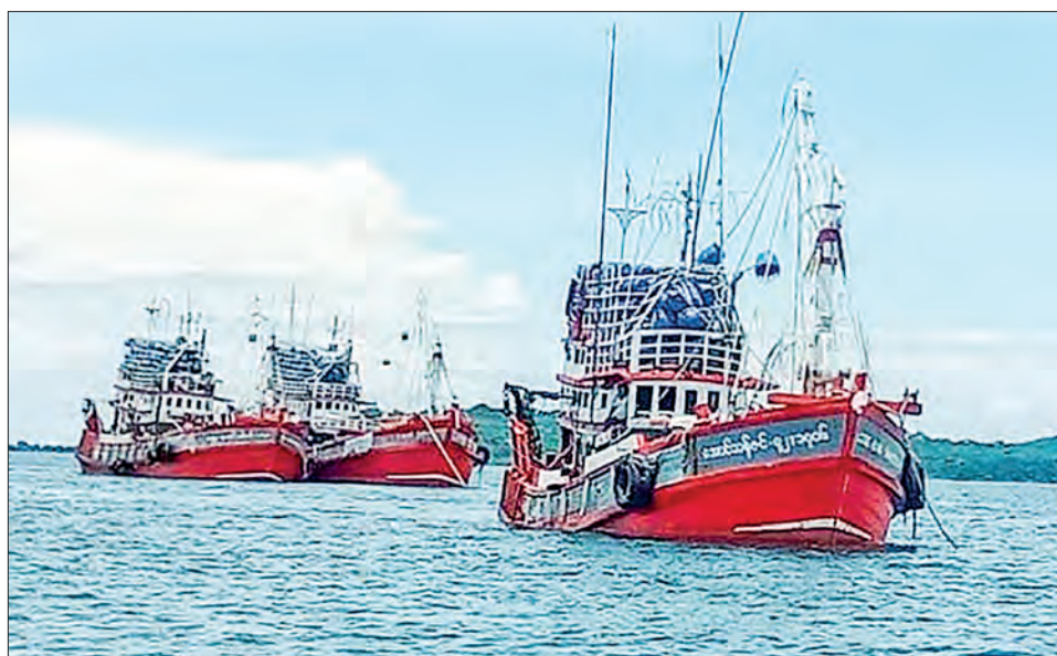
Fishing vessels are seen in Myanmar waters.

MYANMAR exported over 55,900 metric tonnes of fish with an estimated value of US$64.2 million in the first quarter of the current FY 2025-2026 beginning 1 April, according to the Department of Fisheries.