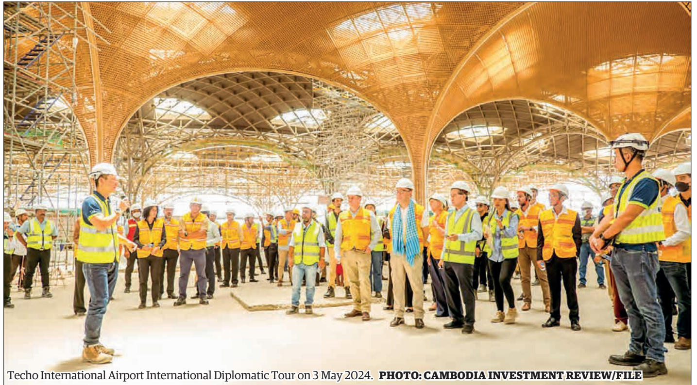
Techo International Airport International Diplomatic Tour on 3 May 2024.

The airport is situated on a 2,600-hectare site in southern Kandal and Takeo provinces, approximately 20 kilometres from Phnom Penh. Construction of the airport began in 2020.