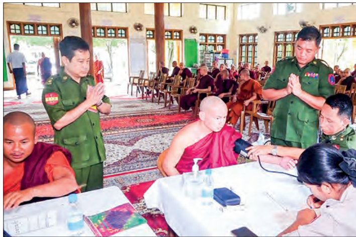
Healthcare services are underway for monks.

Similarly, a mobile team from the Yangon Command conducted medical outreach at Dhammayon Hall in Kalawe Village in Thanlyin Town-