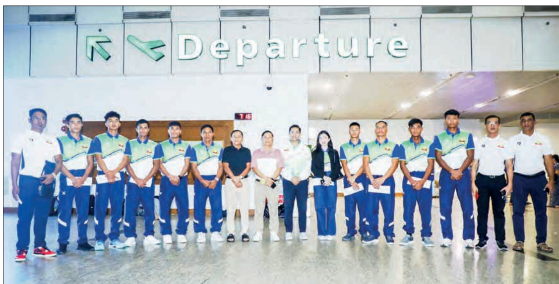
The Myanmar team is seen before the departure for Singapore.