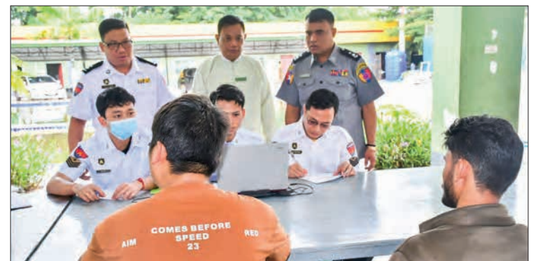
Immigration process underway for the deportation of foreign undocumented entrants.

crackdown on those involved in online scam centres and is taking firm action against foreign nationals operating behind the scenes. Simultaneously, the government is actively cooper-