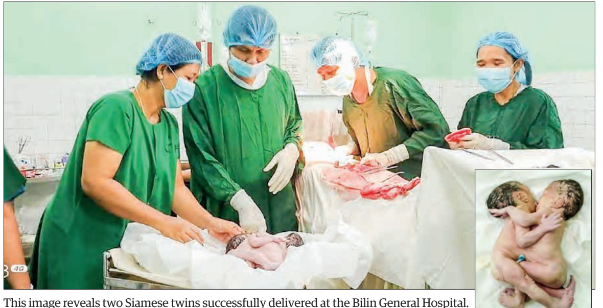
This image reveals two Siamese twins successfully delivered at the Bilin General Hospital.

“We are happy to announce that both mother and the two babies are in good health”, the hospital posted on their social media page.