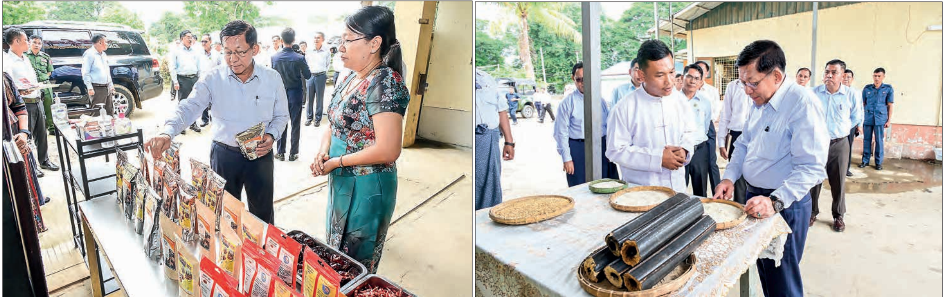
State Administration Council Chairman Prime Minister Senior General Min Aung Hlaing looks into the exhibits produced and displayed by MSMEs from Meiktila District, Mandalay Region.