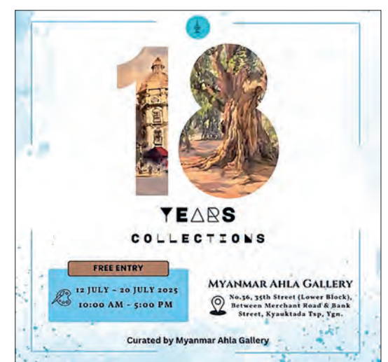
An invite poster for the exhibition.

"The goal is to create a trustworthy space at Myanmar Ahla Gallery where art lovers