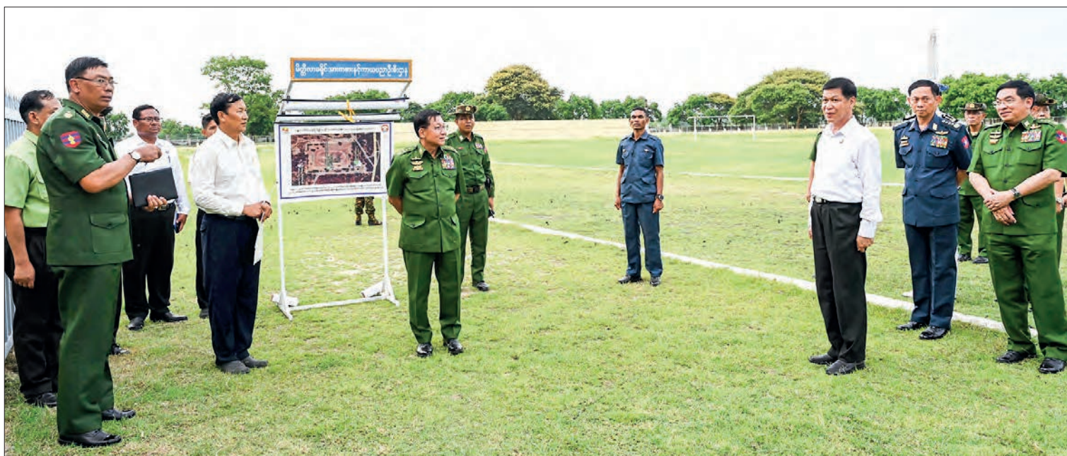
The Senior General views the Meiktila District Stadium, which will be planned to upgrade it.