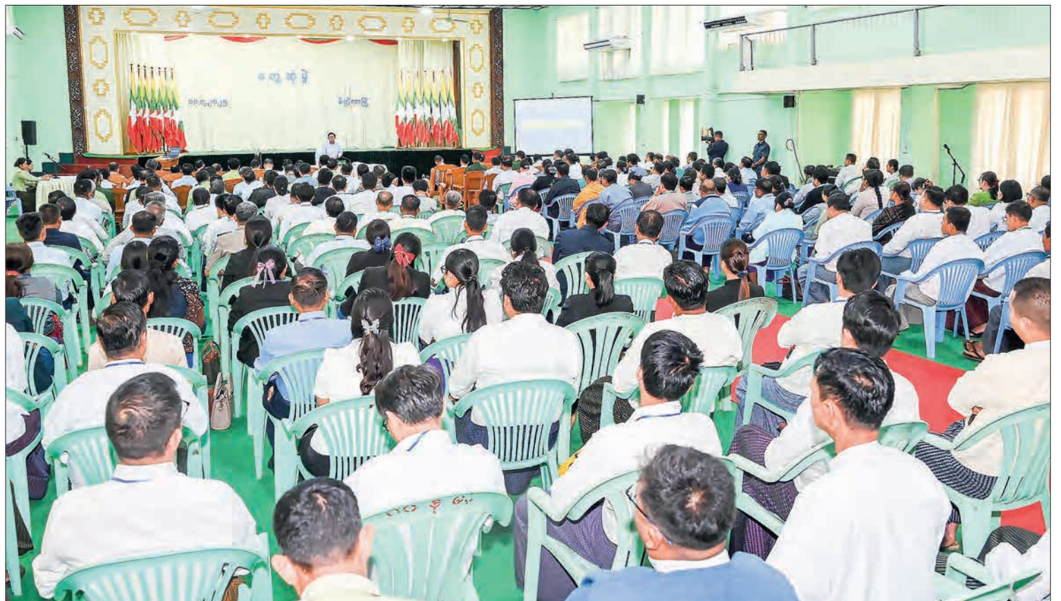
State Administration Council Chairman Prime Minister Senior General Min Aung Hlaing addresses the meeting with district and township-level departmental officials, local elders, and MSME businesspeople from Meiktila District in Mandalay Region yesterday.

S tate Administration Council Chairman Prime Minister Senior General Min Aung Hlaing met district and township-level departmental officials, local elders and MSME entrepreneurs from Meiktila District in Mandalay Region at the Kandaw Mingala Hall in Meiktila yesterday morning and discussed regional development.