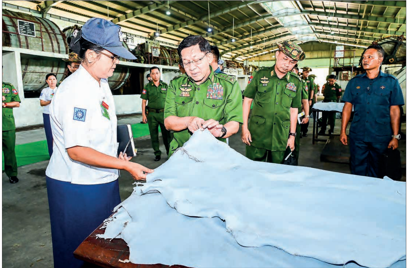
State Administration Council Chairman Defence Services Commander-in-Chief Senior General Min Aung Hlaing looks into the leather material produced by the Tatmadaw Leather Factory (Meiktila).

In his guidance, the Senior General said that Tatmadaw manages the distribution of clothes and equipment produced by Tatmadaw factories for the convenience of Tatmadaw members, similar to gov-