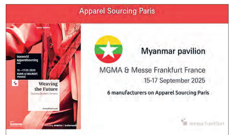
Images of Apparel Sourcing Paris.

Including this time, MGMA has participated in the Apparel Sourcing Paris for five years. The deadline for applications is 25 July, and for product samples is 7 August. For more information, enquiries can be made in person at the MGMA office or 09 758451158. — MT/ZS