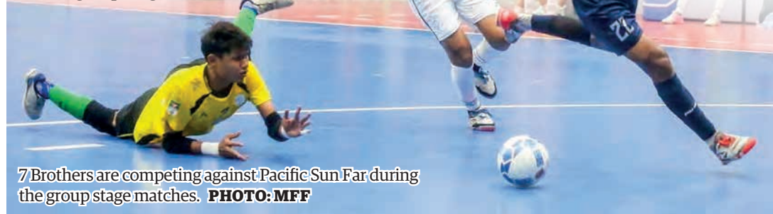
7 Brothers are competing against Pacific Sun Far during the group stage matches.