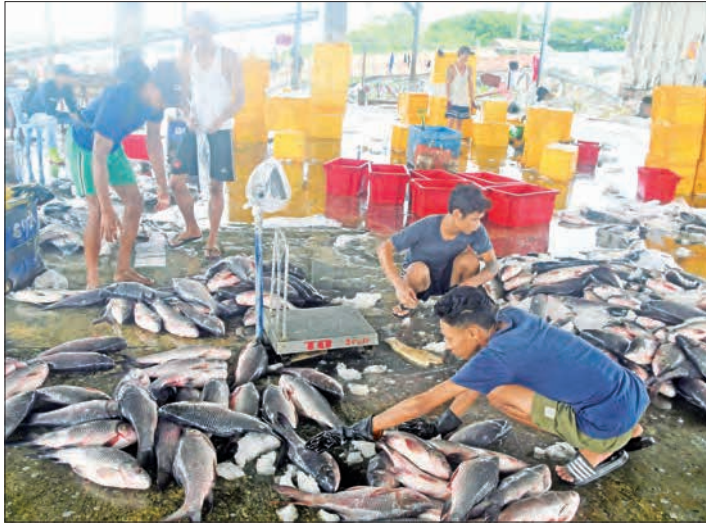
This picture shows Kyimyindine and Hlaing fish markets with bustling trade activities.

"Seafood businesses are thriving this year. Seafood supply meets the satisfaction of both consumers and sellers. Fish stored in cold storage were sold in the market in the previous fishing off-season," said a trader involved in Sanpya Fish Market.