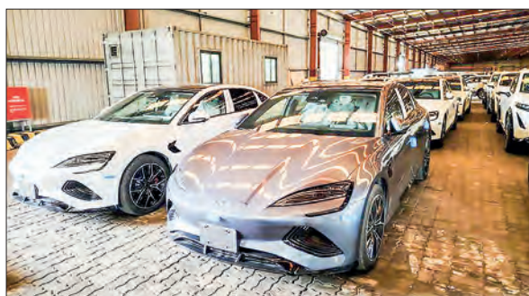
This image showcases imported EVs at Yangon Port.