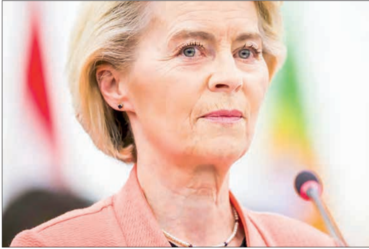
EU Commission President Ursula von der Leyen.

Ursula von der Leyen survived the vote by a significant margin, with 360 Members of the European Parliament (MEPs) rejecting the motion, 175 supporting it, and 18 abstaining.