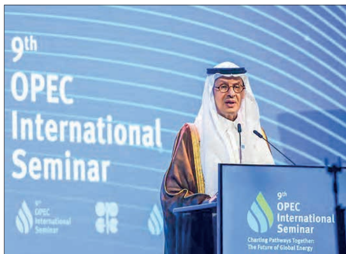
Saudi Energy Minister Abdulaziz bin Salman Al Saud delivers a speech at the opening ceremony of the 9th OPEC International Seminar in Vienna, Austria, on 9 July 2025.