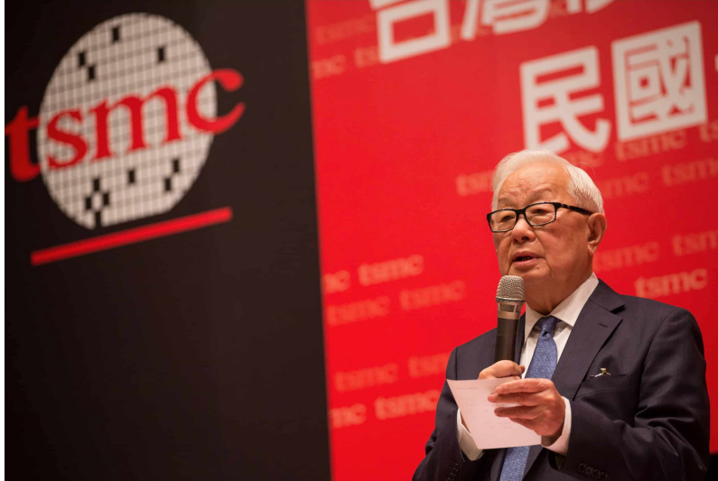
Morris Chang, chairman and founder of Taiwan Semiconductor Manufacturing Company Ltd. (TSMC), speaks at the company’s annual general meeting in Hsinchu, Taiwan, on Tuesday, June 9, 2015. Chang expects sales to rise at least 10 percent this year.