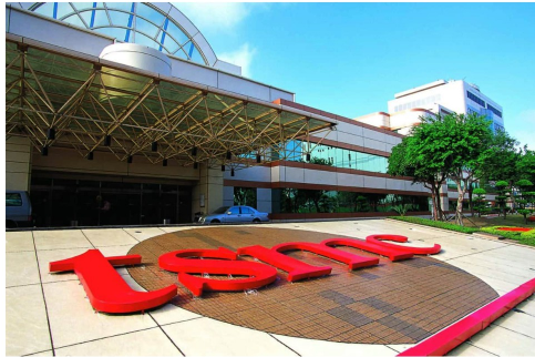
TSMC produces more than half of the world's semiconductors.

simplified Chinese, the script used on mainland China but not Taiwan. Over time, Wu also noticed the adversaries worked a “996 shift” — 9 a.m. to 9 p.m. Beijing time, six days a week — which is a hallmark of the Chinese tech industry, and they were absent on mainland Chinese holidays.