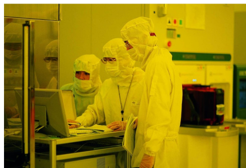
TSMC 12-inch Wafer Fabs.

But all that came to a halt when the Trump administration blocked Huawei, the Chinese telecom giant, from buying chips made with U.S. equipment. American semiconductor firms have about 50 percent of the global market, and they’re hard to avoid. TSMC uses software, tools, and equipment from a range of American companies, including Applied Materials, IBM, and Lam Research, along with EUV scanners from ASML , a Dutch company that sources