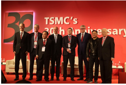
Apple Inc COO Jeff Williams, left, and Morris Chang, right, during a panel discussion to celebrate TSMC's 30th Anniversary.